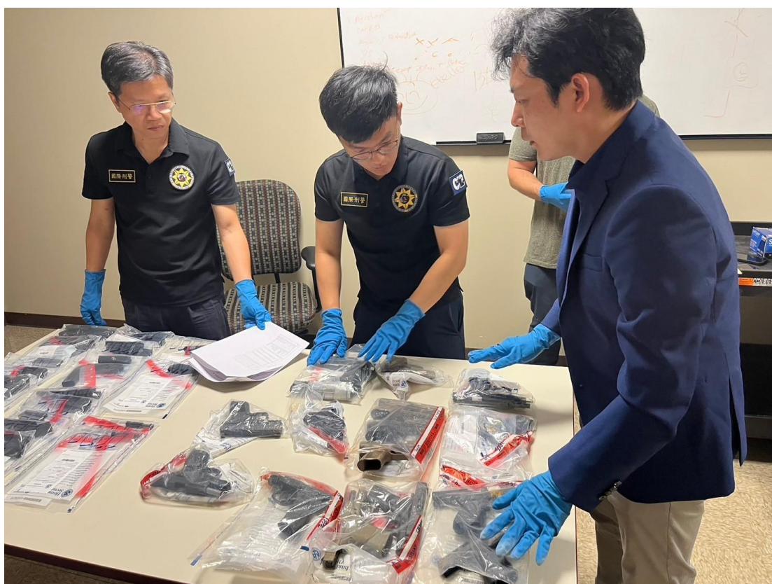
(Photo: The prosecutor(right), along with officers from the Criminal Investigation Bureau (CIB), traveled to the United States to conduct a firearms evidence inventory, accompanied by agents from Homeland Security Investigations (HSI).)