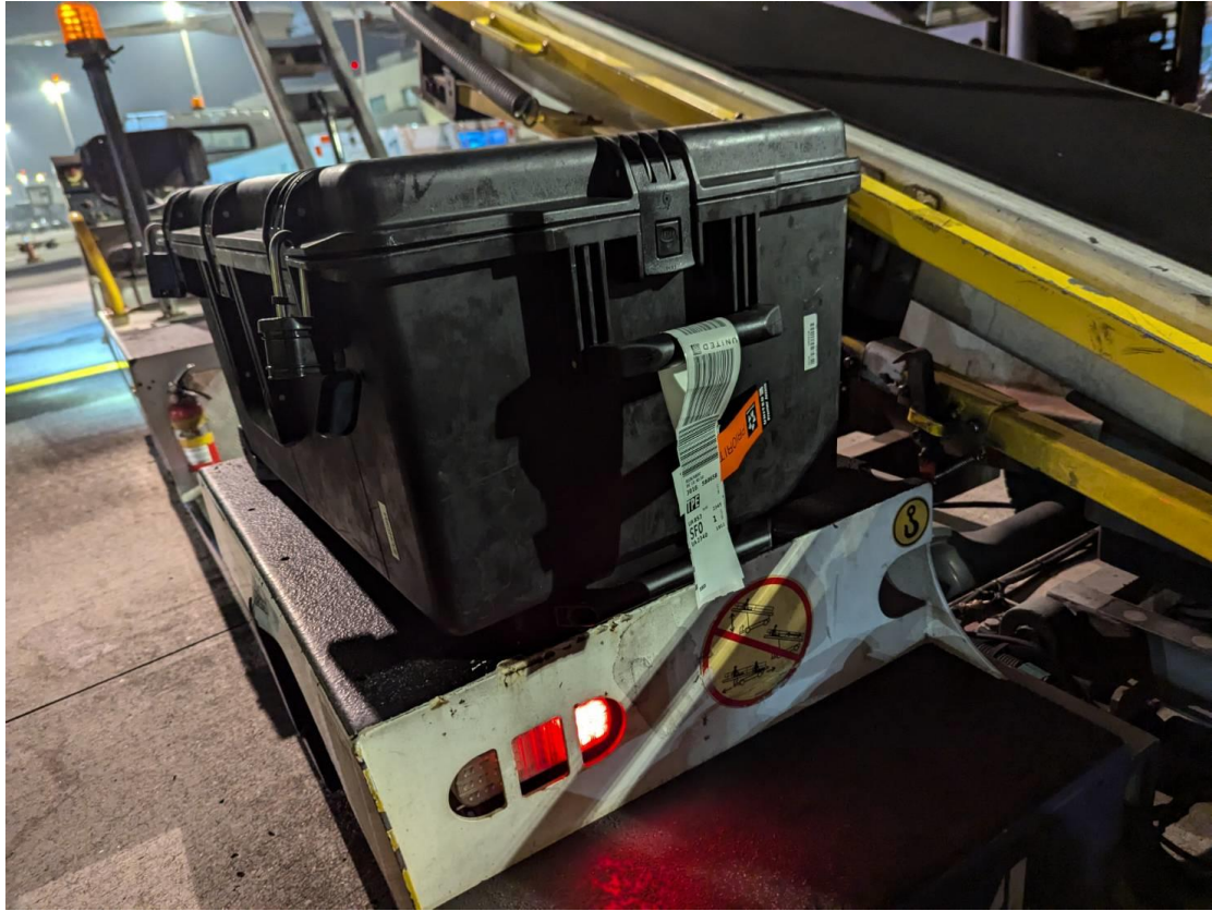
(Photo: The seized firearms (stored in a black suitcase) successfully arrived at Taiwan Taoyuan International Airport from the United States.)